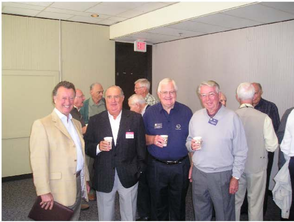
Fellowship and Coffee before September's Annual meeting